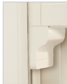
Sash Horns in 3 styles