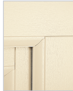
Colour and Texture